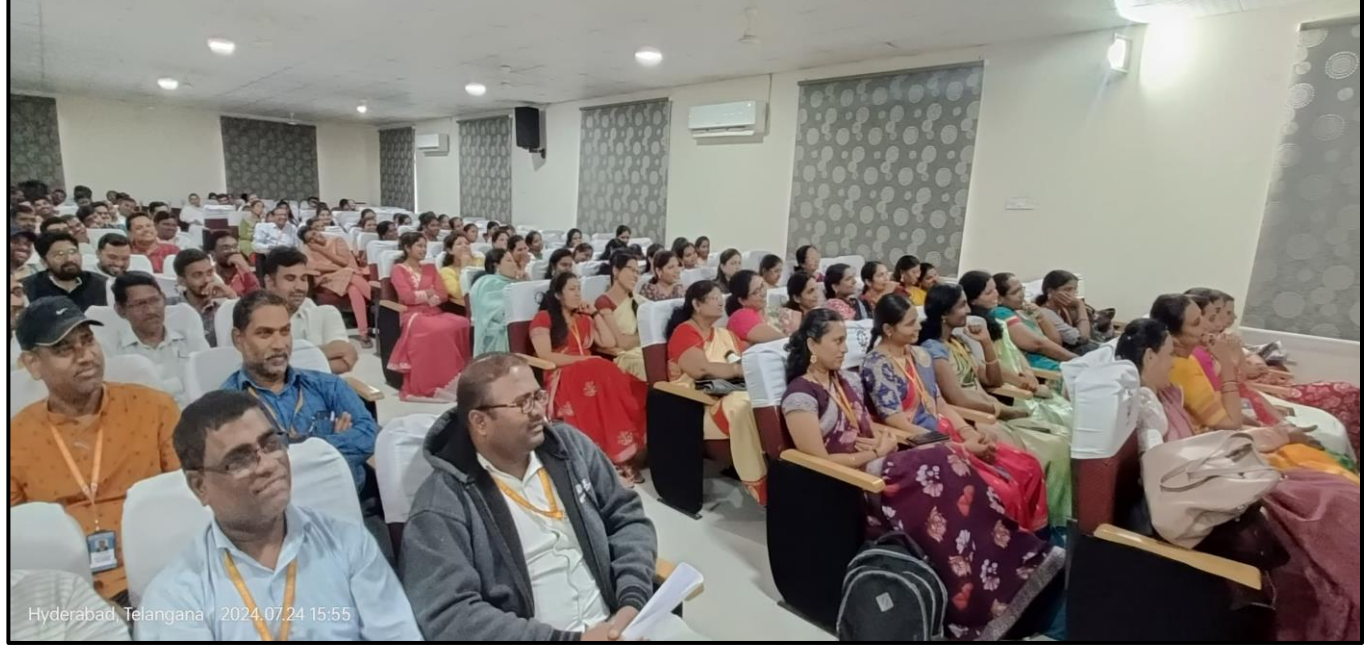
Participants of the Guru Vandanam Program in MRCE Seminar Hall